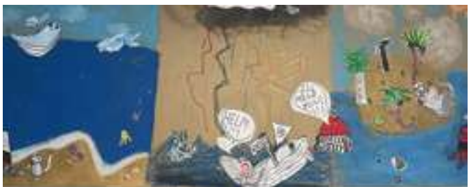
'O le Fe'e ma le 'Isumu, The Octopus and the Rat